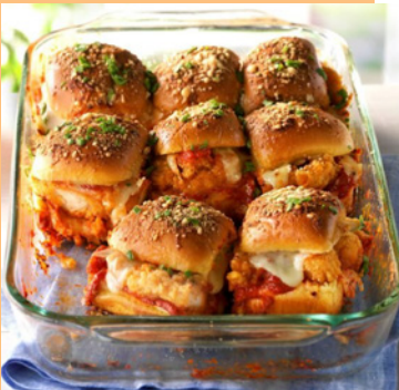
Regent Park Recipe Corner: Chicken Parmesan Sliders. We will have to try these out at Happy Hour!

In astrology, those born between October 1–22 balance the scales of Libra. Libras have strong intellects and keen minds. As masters of compromise and diplomacy, they act as wise mediators. Those born from October 23–31 are Scorpio’s