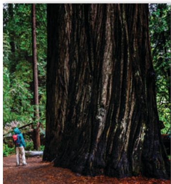
Coast redwoods can reach towering heights over 300 feet tall.

old-growth forests, and many stands of trees were saved, but the outbreak of World War II led to a construction boom, and once again the trees were eyed as a rich source of lumber. It was not easy for President Lyndon Johnson to sign legislation establishing Redwood National Park, but thankfully, 58,000 acres of forest were set aside for preservation. Today that number has grown to over 130,000 acres, providing a safe haven for the world's tallest trees.