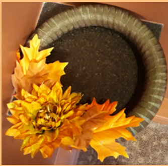
Fall wreath craft created by one of our residents.

“Everything you see I owe to spaghetti.”