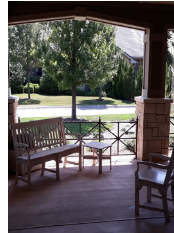
Patio visits will continue for now, weather permitting.

We are very excited to announce that we will be using the more up to date County Positivity rates for our visitation policies. Sedgwick County, currently, has a positivity rate of 5%.